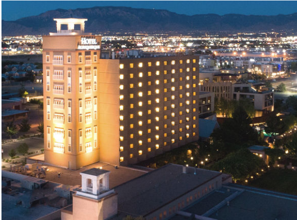
HOTEL ALBUQUERQUE NIGHTS 1 - 2 ALBUQUERQUE, NEW MEXICO