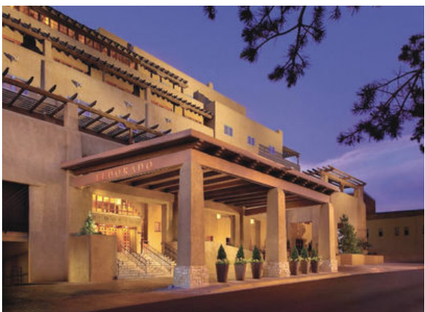
ELDORADO HOTEL & SPA NIGHTS 5 - 7 SANTA FE, NEW MEXICO