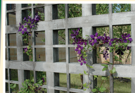
20 Jackmanii Clematis

*Please note that plants 16, 24, 25 and 28 can be viewed only from the windows inside the Nina Mason Pulliam Education Center.