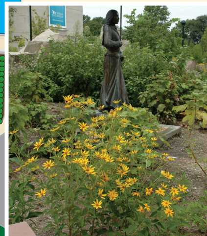
24 False Sunflower near Southwest Summer Showers by Doug Hyde