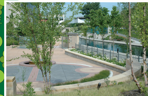
3 Heritage River Birch Trees