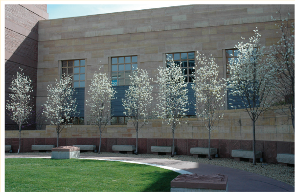
2 Serviceberry Trees

Art meets nature in a unique setting along the Indianapolis Canal Walk at the Eiteljorg Museum. Whether you are looking for a quiet respite or the opportunity to learn more about Indiana native plants, the Eiteljorg Gardens are a treat for the senses whatever the season.