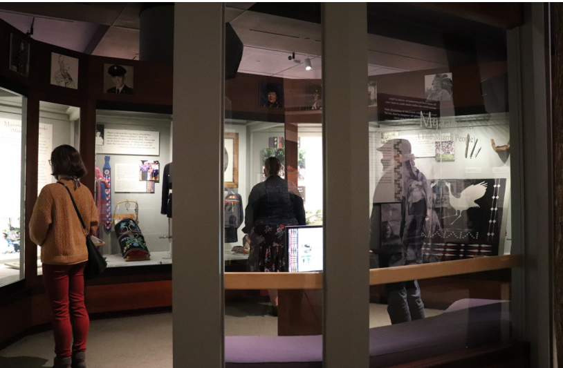
Look at different ways Native American people create art,

Here, we can watch a video while staying six feet apart from others,