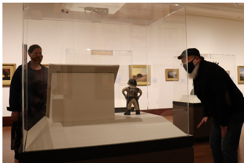
We can think about what I like most about it. Do I like the colors, or the shapes, or what it is showing me?

I can go home and make my own art too, and think about the cool things we saw at the museum while doing it!