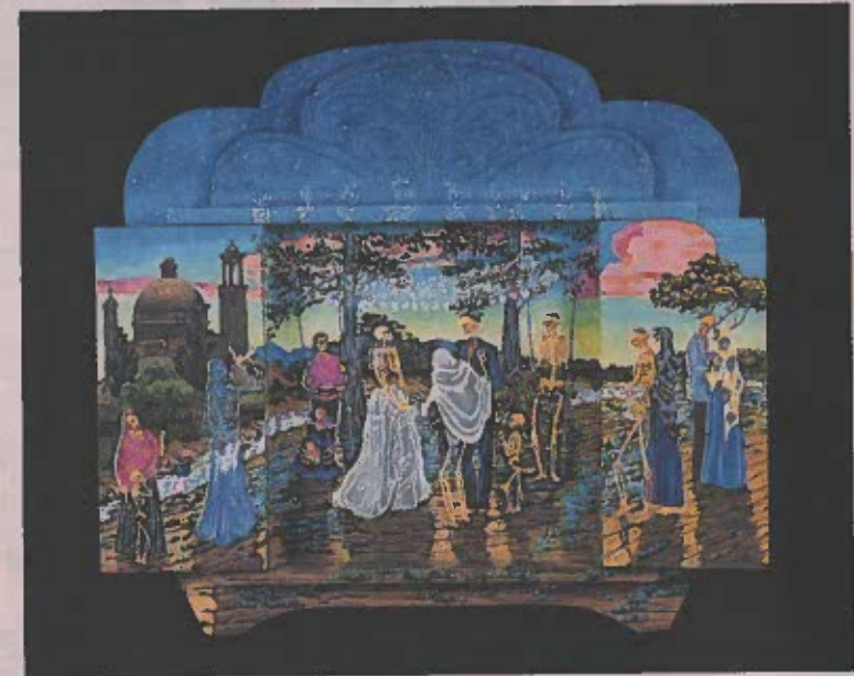
Clockwise from top left: Works hang as part of "Powerful Women: Contemporary Art from the Eiteljorg Collection," now on display at the Eiteljorg Museum in Indianapolis. // The exhibition explores the work of visionary women artists who shaped and changed the ways people think about contemporary art. // "Boda Bacalar" by Anita Rodriguez is part of the exhibit.