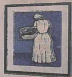
Clockwise from top: “Fancy Shawl Project” by Wendy Red Star is part of “Powerful Women: Contemporary Art from the Eiteljorg Collection,” now on display at the Eiteljorg Museum in Indianapolis. The exhibition explores the work of visionary women artists who shaped and changed the ways people think about contemporary art. // “Opposites Attract” by Anita Fields is part of the exhibit. // Works, including “Sisters” by Hung Liu, are now on display at the Eiteljorg Museum.